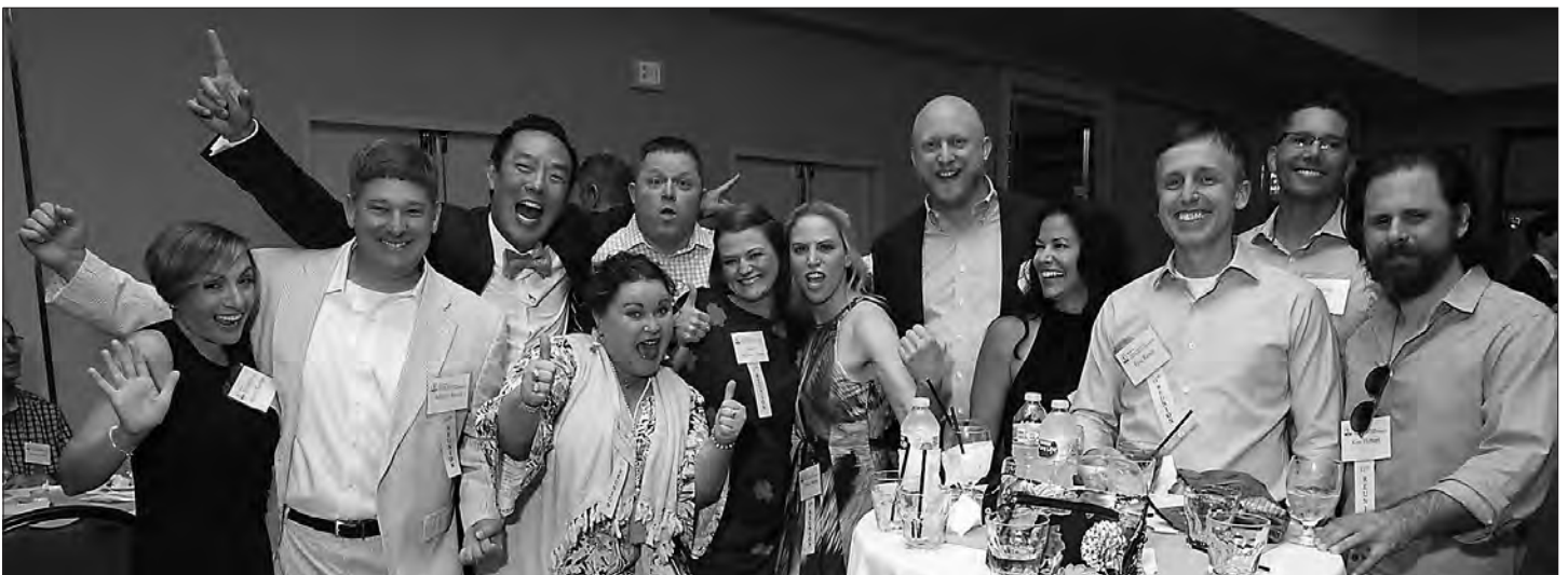
Jubilant members of the Class of 2004