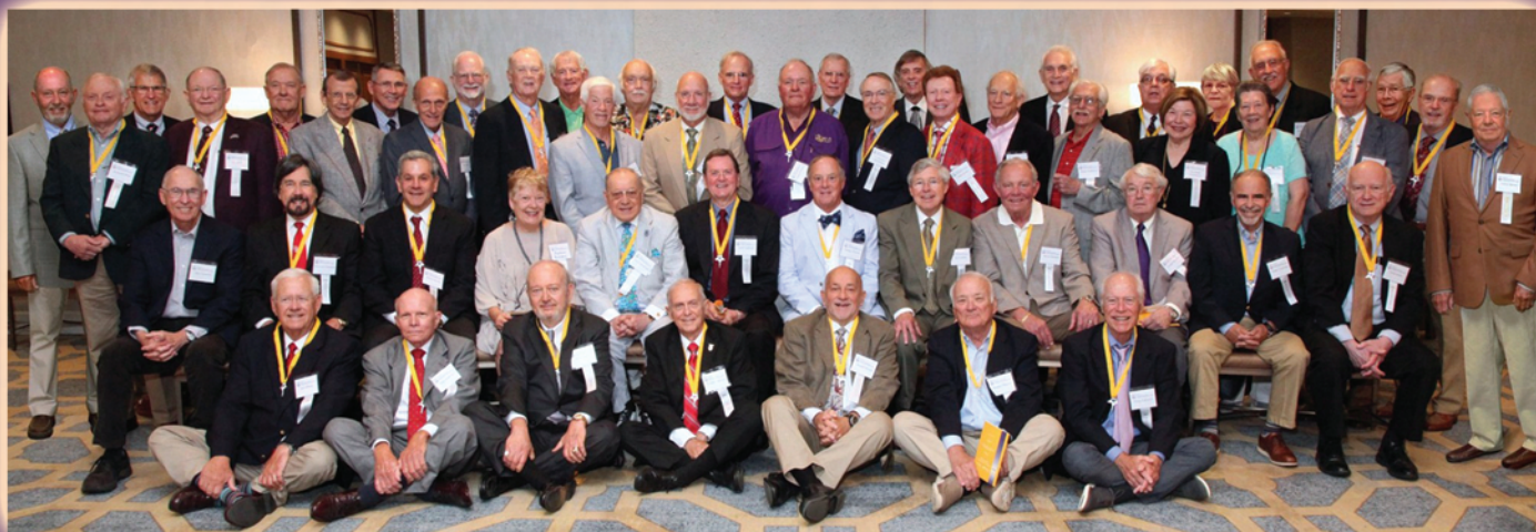
Class members in the photograph are identified on page 31.