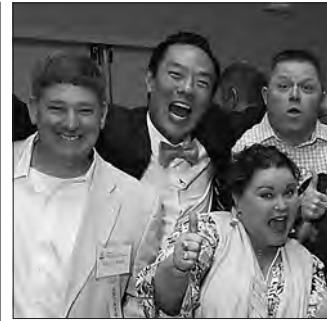
Jubilation! See page 9 to view ecstatic members of the Class of 2004.

To improve and expedite information exchange, the Office of Alumni Affairs is developing a list serve for alumni who prefer electronic communications in addition to our regular mailed publications. If you would like to be included on our electronic list, please send your email address to: roar@lsuhsc.edu .