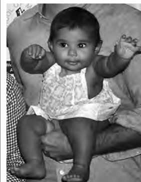
Tiger Cubs... younger each year.