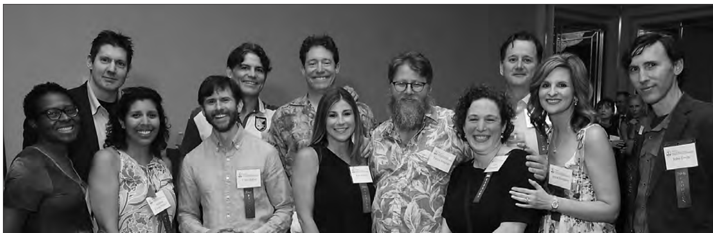
Members of the Class of 1999